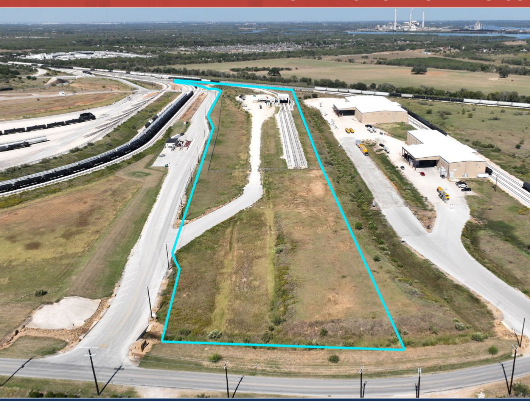
Part of a 520 Acre Master-Planned Rail-Served Industrial Park