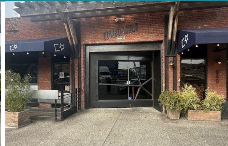
Cowboy Star and Butcher