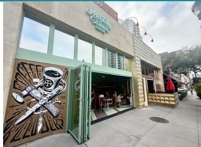
Modern Times Coffee The Invigorium