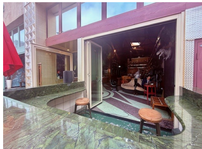
The Knotty Barrel