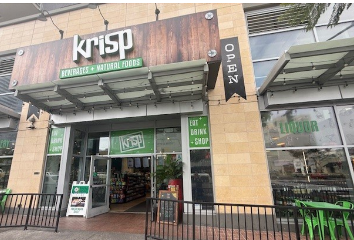
Krisp Beverage and Natural Foods