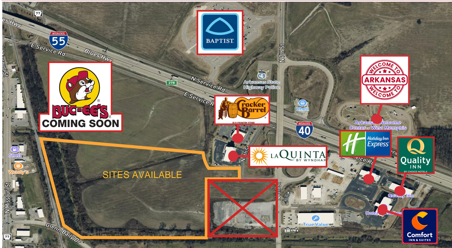
South Half TH Aerial