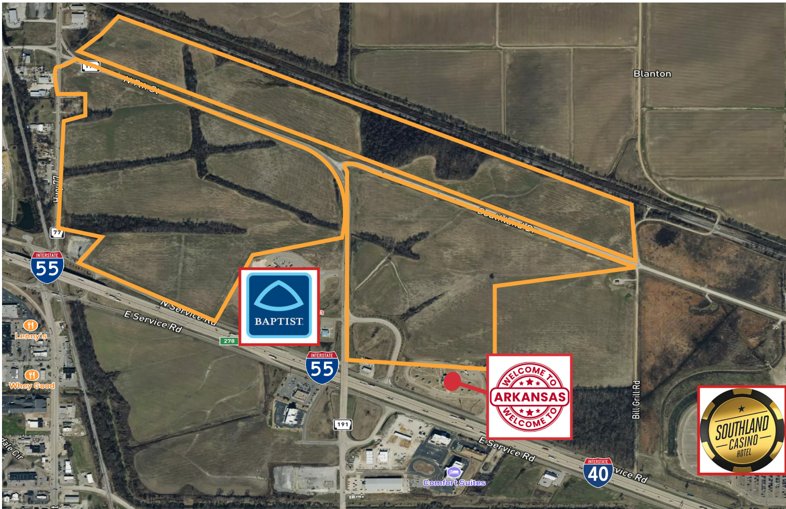
North Half TH Aerial