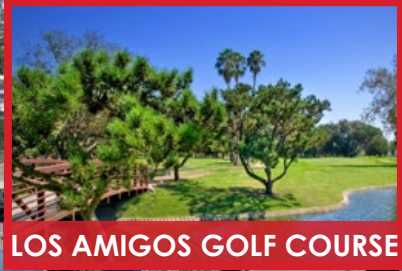
LOS AMIGOS GOLF COURSE