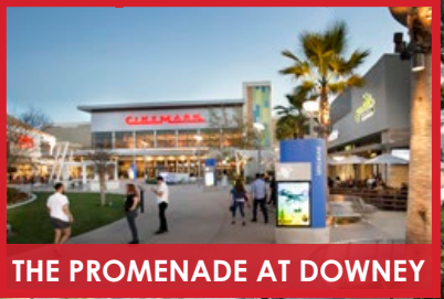
THE PROMENADE AT DOWNEY