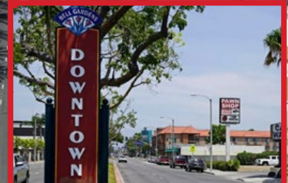
DOWNTOWN BELL GARDENS