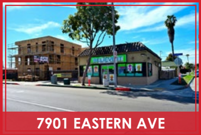
7901 EASTERN AVE