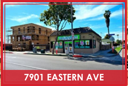
7901 EASTERN AVE