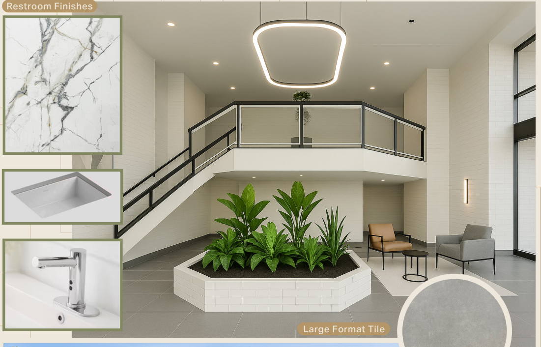
Large Format Tile