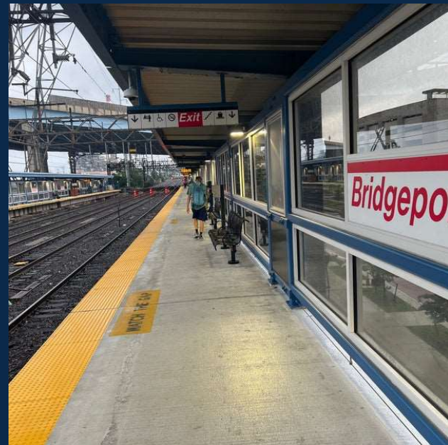
Walk to Bridgeport's Metro North & Amtrack Stations