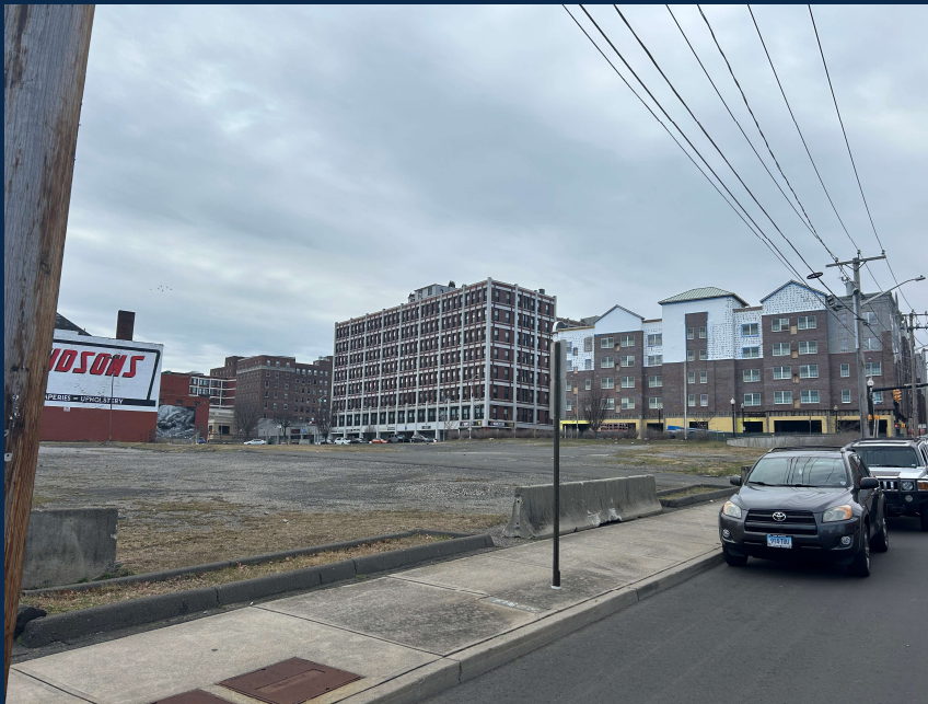
Redevelopment Site Across the Street