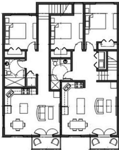
UPPER FLOOR - APARTMENTS