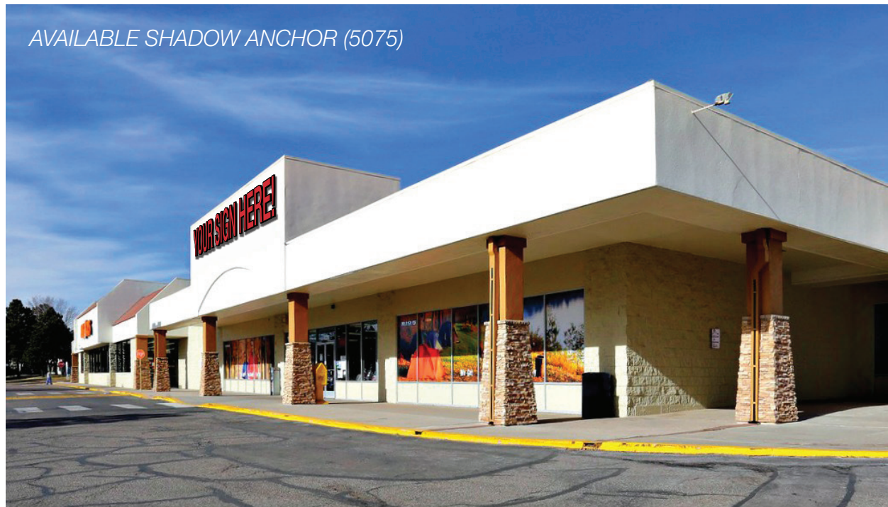
AVAILABLE SHADOW ANCHOR (5075)