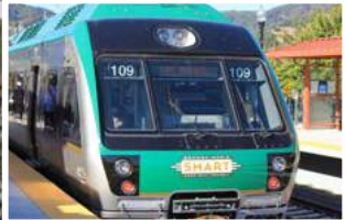
NOVATO HAMILTON SMART TRAIN STATION