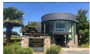
384 BEL MARIN KEYS