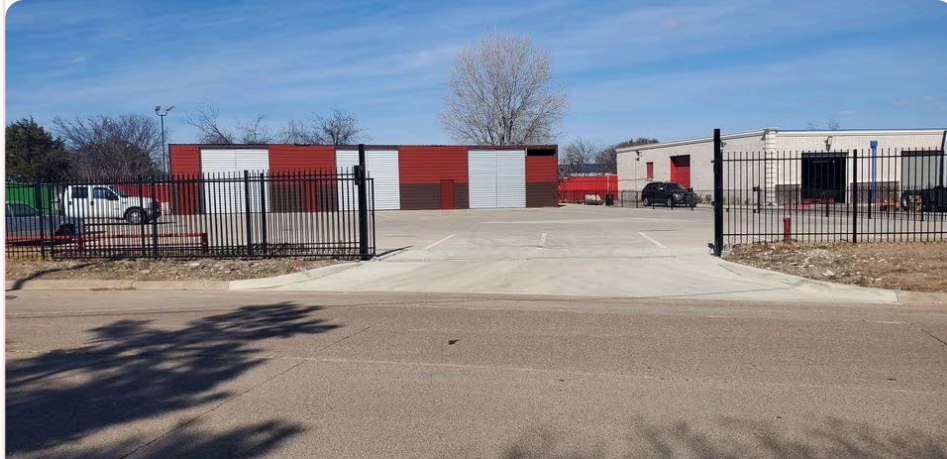
Additional buildings exterior