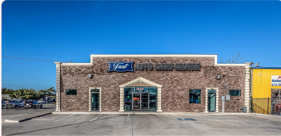
Main Entrance Area