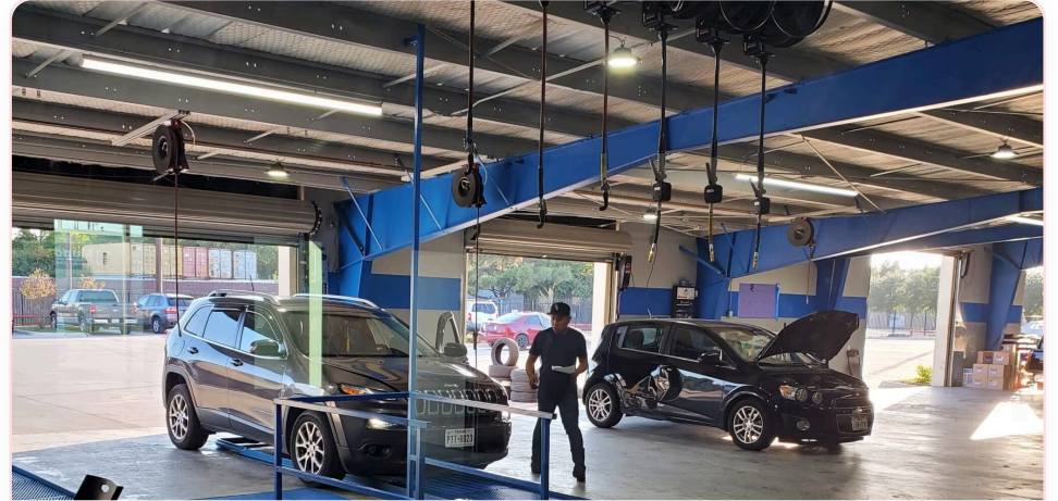
Mechanic shop interior bay