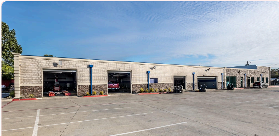
Mechanic shop exterior bay