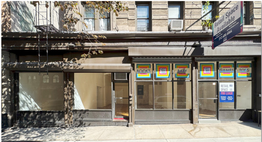
Basement: 695 sf