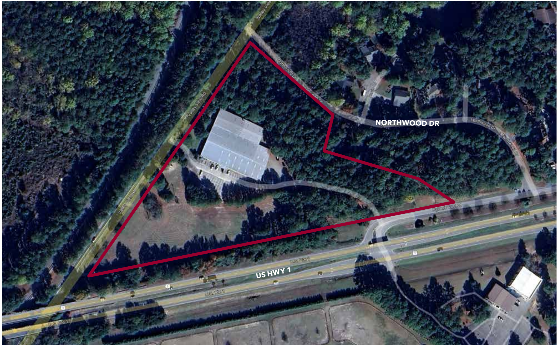
INDUSTRIAL BUILDING FOR SALE | 845 VALLEY VIEW ROAD | SOUTHERN PINES, NC 28387