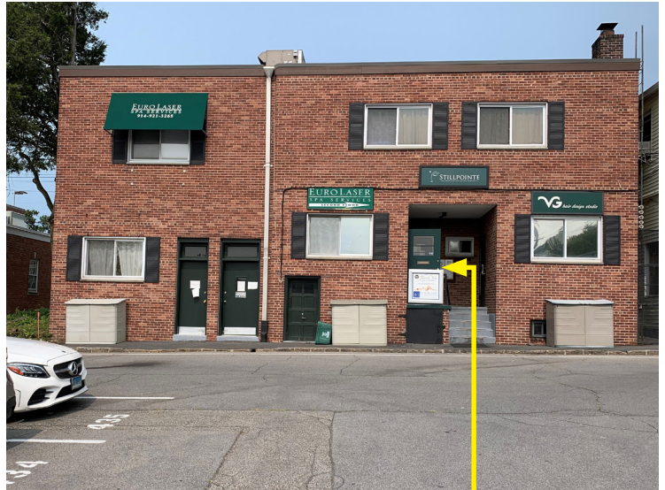
ADDITIONAL ENTRANCE FROM PARKING LOT