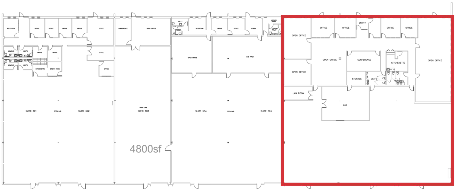
AS-BUILT FLOOR PLAN Scale: 1/8" = 1'-0"