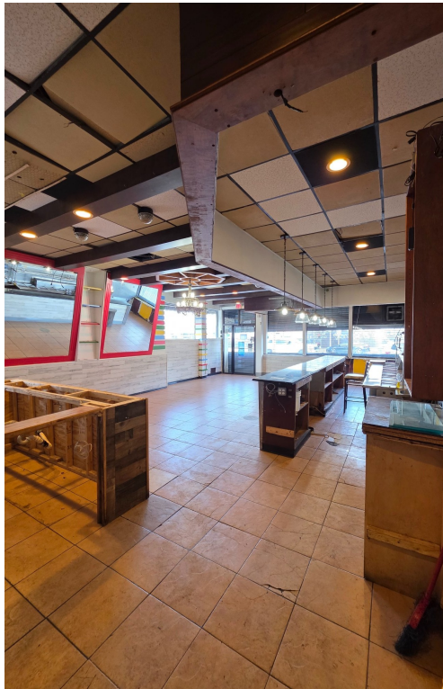
GROUND FLOOR INTERIOR