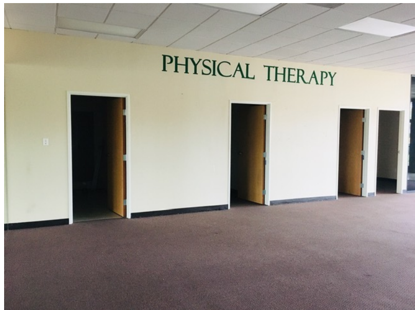
Space 4225: 1,809 SF Office/Retail or Restaurant Space