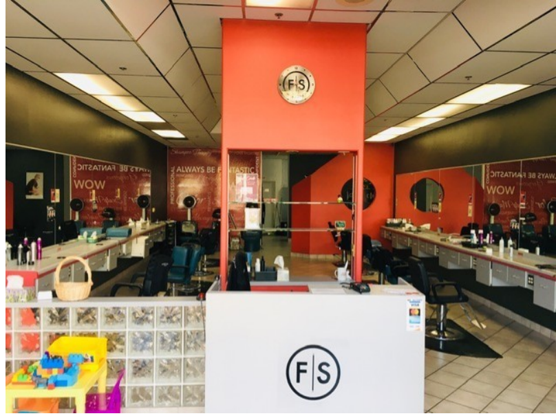
Space 4271: 1,260 SF Barber Shop or Hair Salon