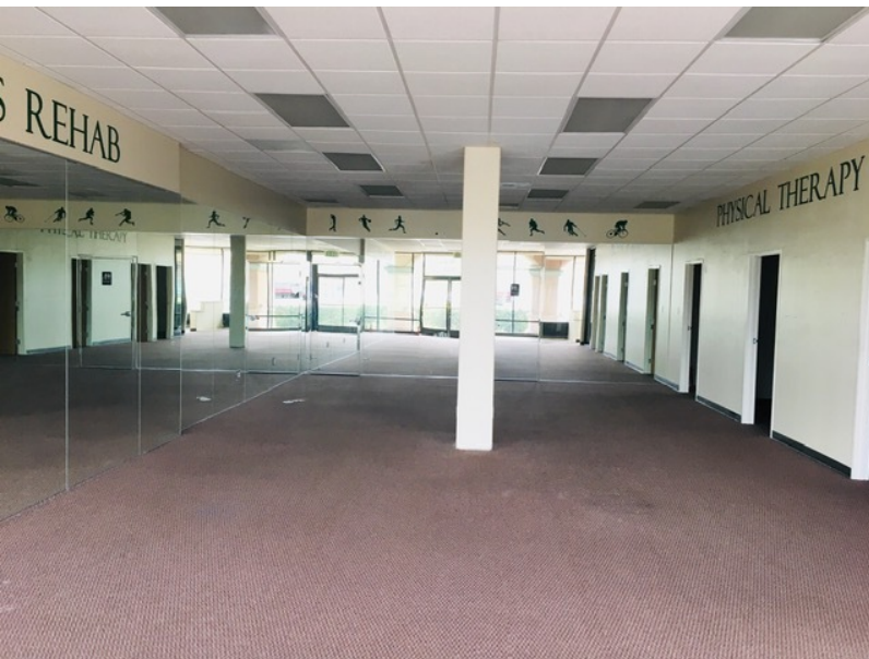
Space 4225: 1,809 SF Office/Retail or Restaurant Space