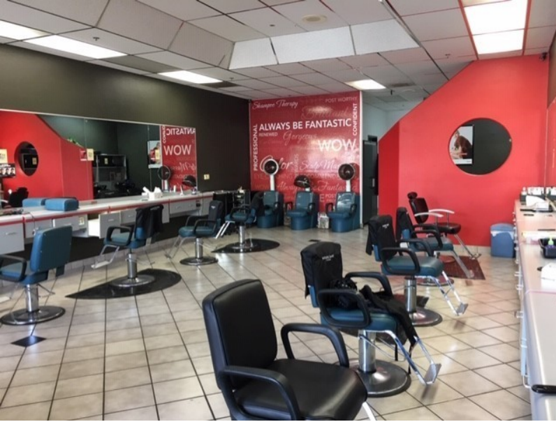
Space 4271: 1,260 SF Barber Shop or Hair Salon