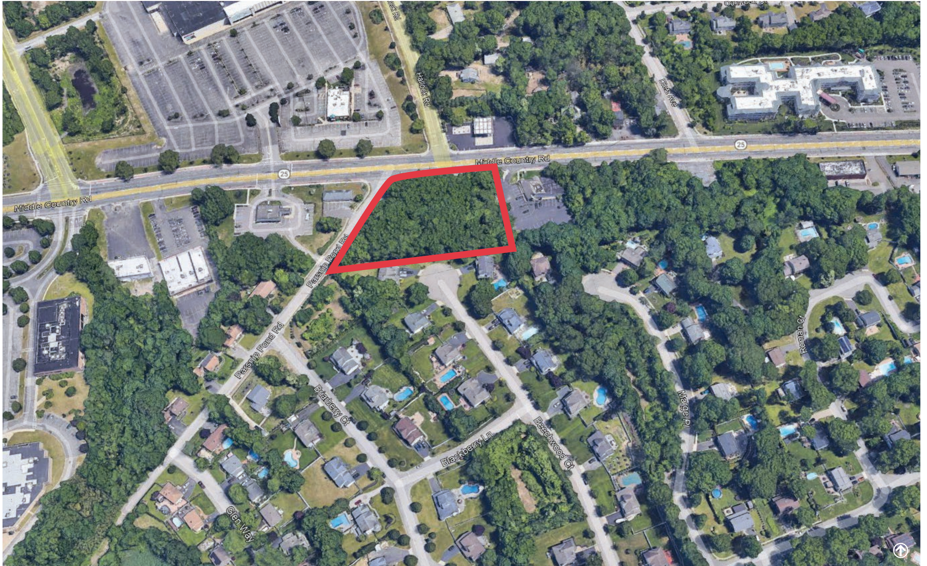
CORNER OF MIDDLE COUNTRY ROAD AND PARSNIP POND ROAD LAKE GROVE, NEW YORK