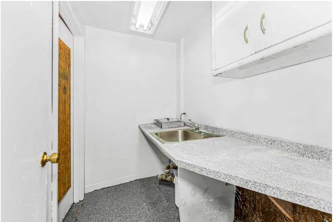
665 Thwaites Pl