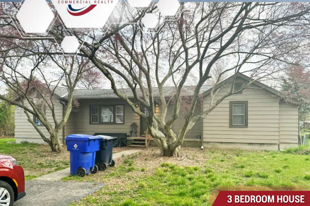
3 BEDROOM HOUSE