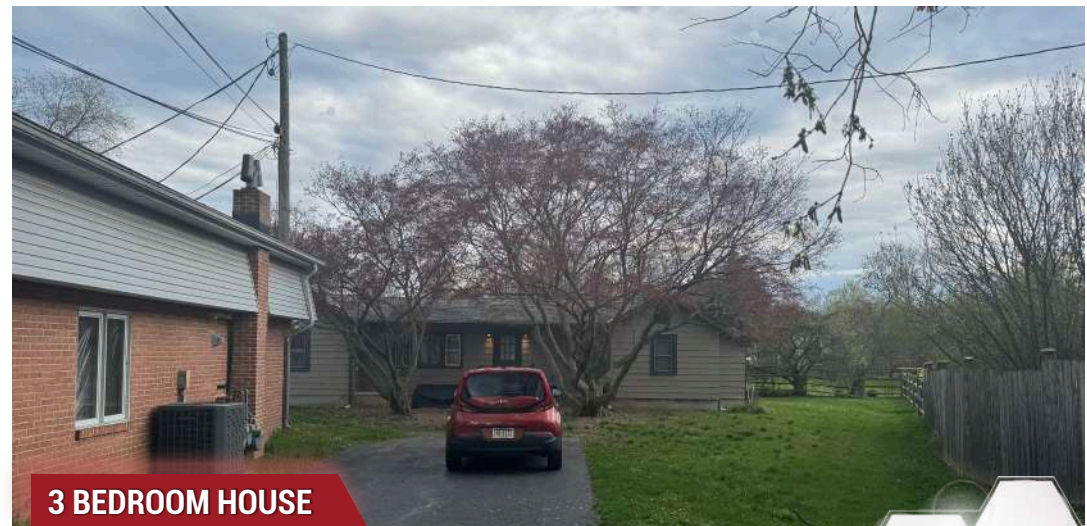
3 BEDROOM HOUSE

LANDMARK COMMERCIAL REALTY 425 N 21 ST STREET, SUITE 302 CAMP HILL, PA 17011 P : 717.731.1990