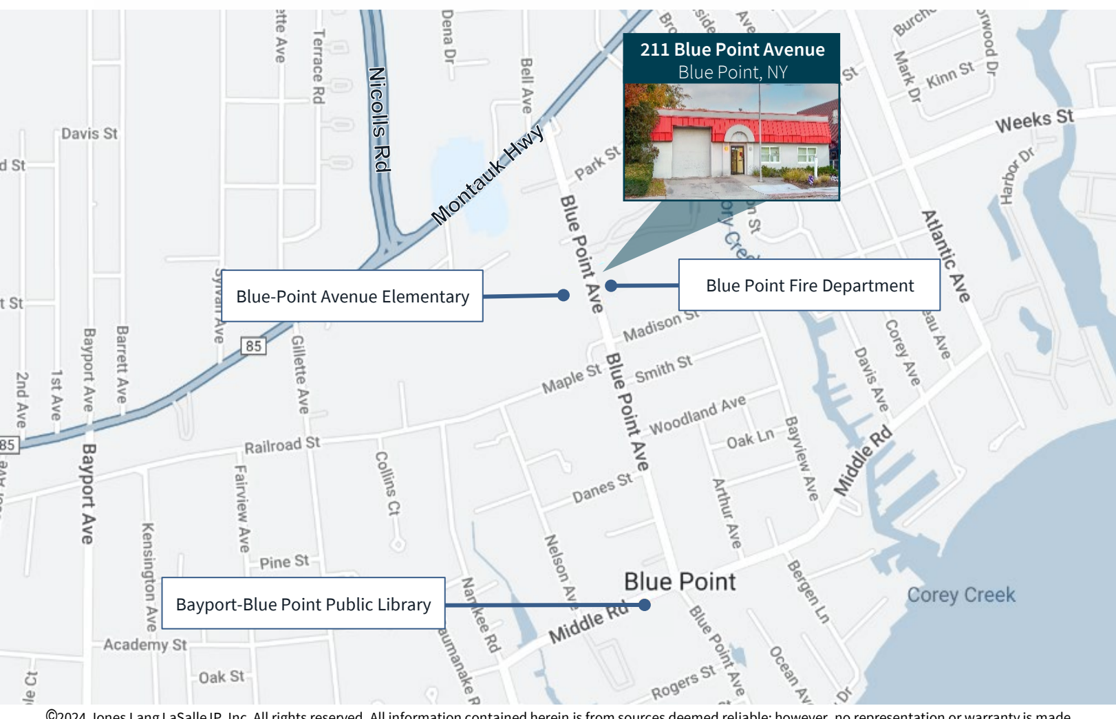
©2024 Jones Lang LaSalle IP, Inc. All rights reserved. All information contained herein is from sources deemed reliable; however, no representation or warranty is made to the accuracy thereof.