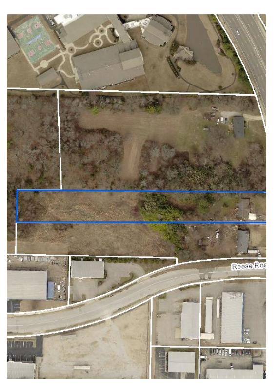
2557 Whitten Rd