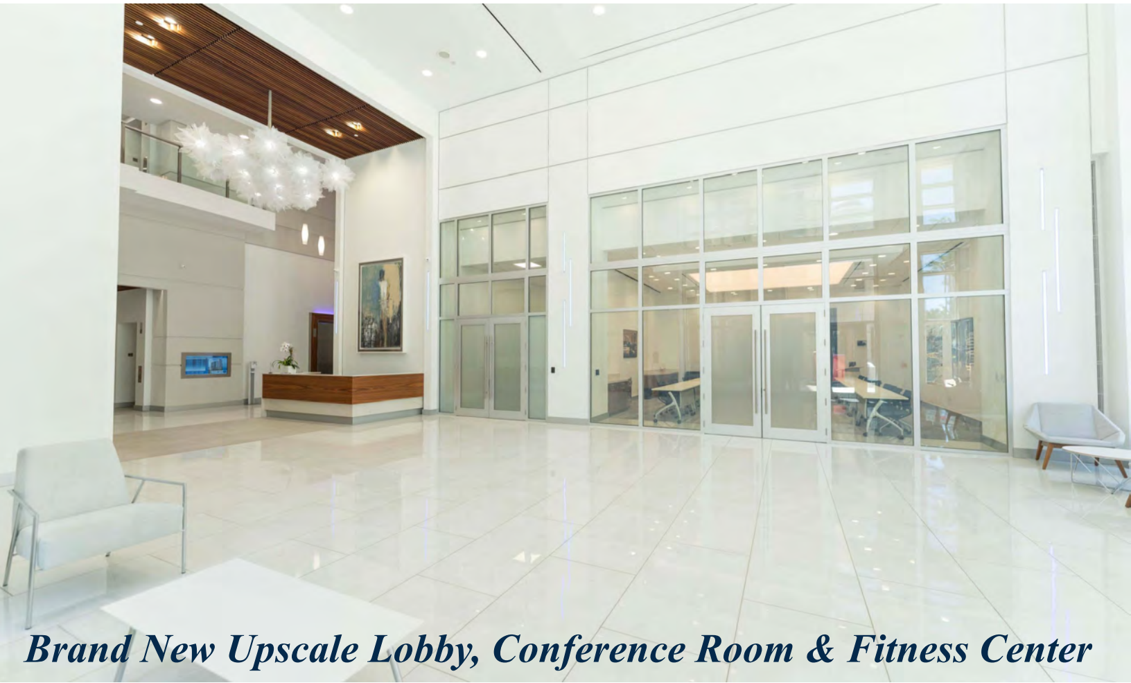
Brand New Upscale Lobby, Conference Room & Fitness Center