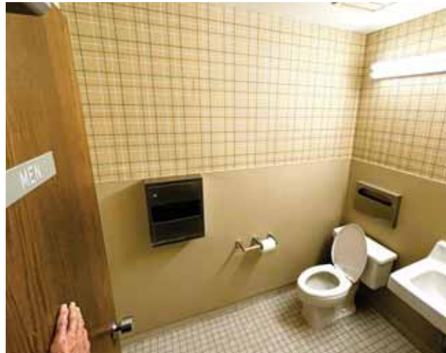
Second Floor - 6962 Almaden Expressway