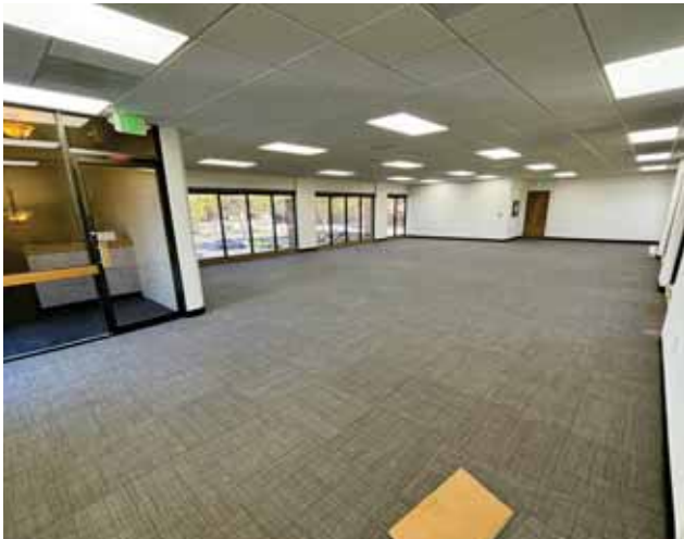
Second Floor - 6962 Almaden Expressway