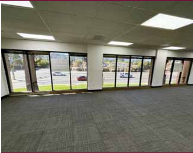
Second Floor - 6962 Almaden Expressway