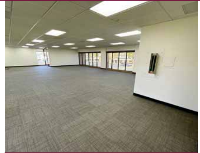
Second Floor - 6962 Almaden Expressway