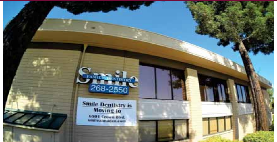
6962 Almaden Expressway - Second Floor