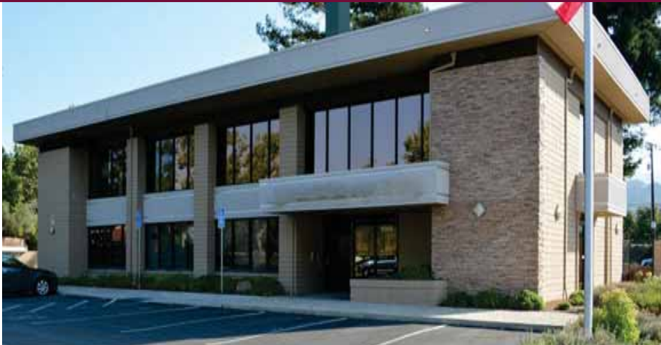
6964 Almaden Expressway - Ground Floor