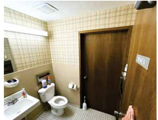
Second Floor - 6962 Almaden Expressway