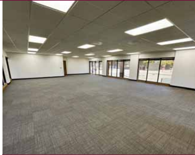
Second Floor - 6962 Almaden Expressway