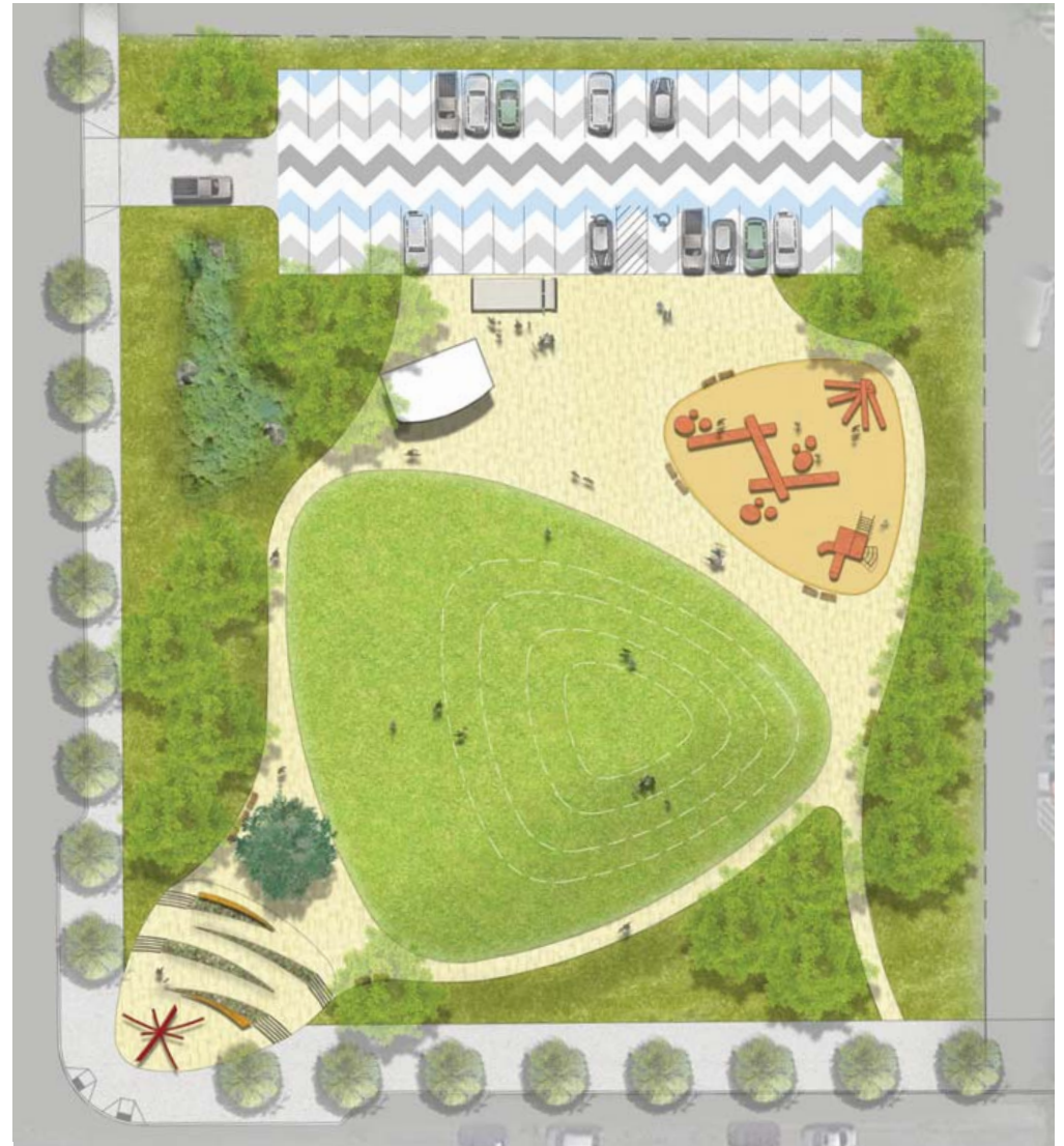
CONCEPTUAL LYNNWOOD TOWN SQUARE PARK PLANS