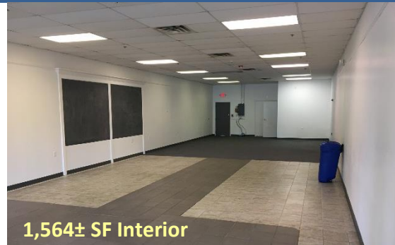
1,564± SF Interior