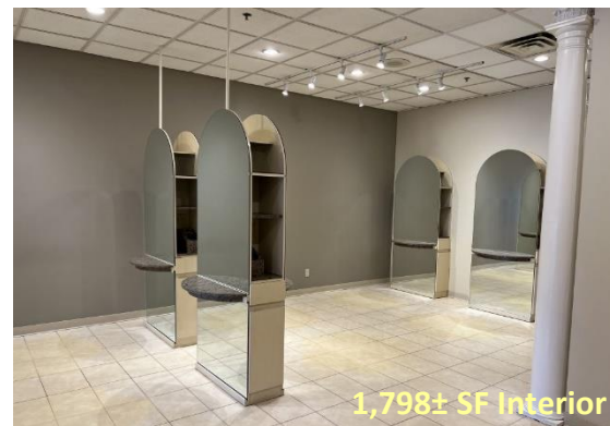
1,798± SF Interior