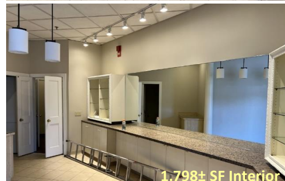
1,798± SF Interior