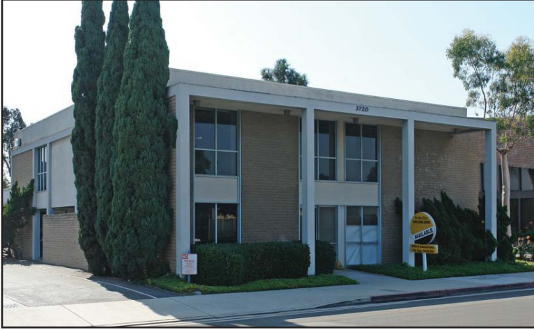
3720 Campus Drive