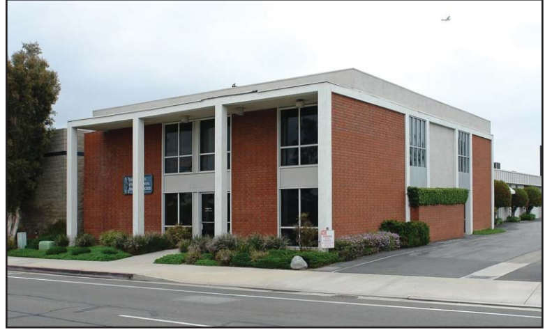
3740 Campus Drive