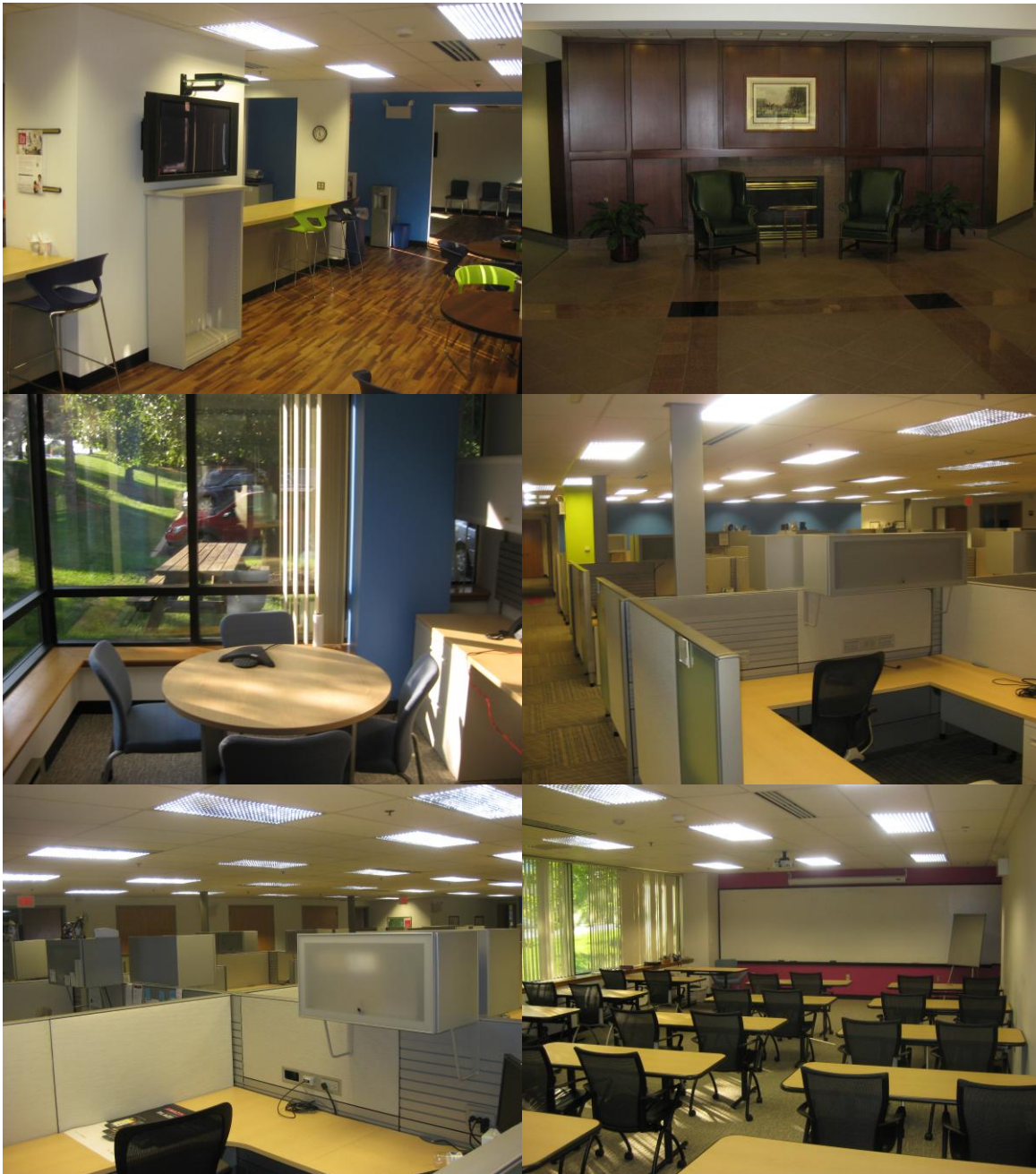
Photos of past occupancy, delivered without furniture