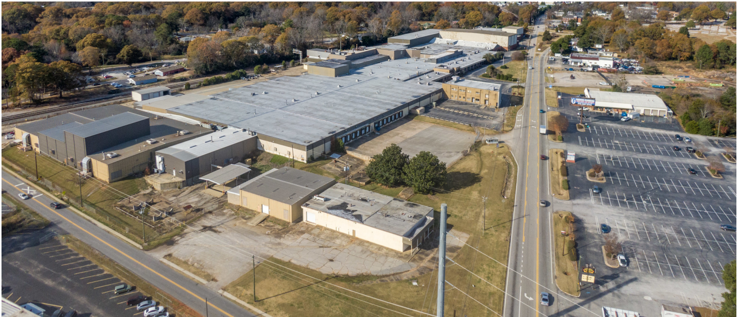
Suite E: Front Truck Court - Macon Street Entrance