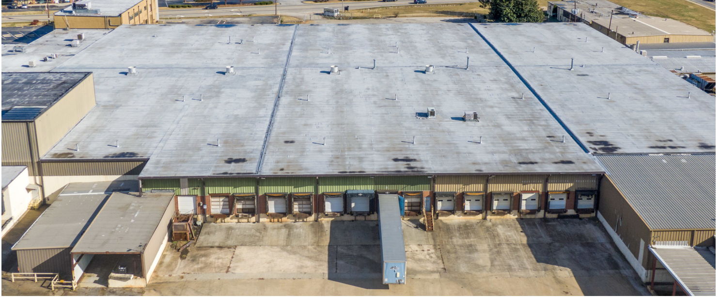
Suite E: Rear Truck Court - Off Racetrack Road