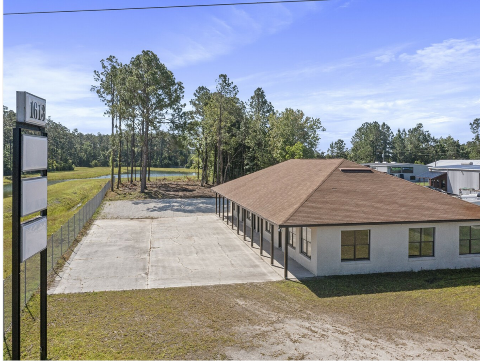
Signage & Parking