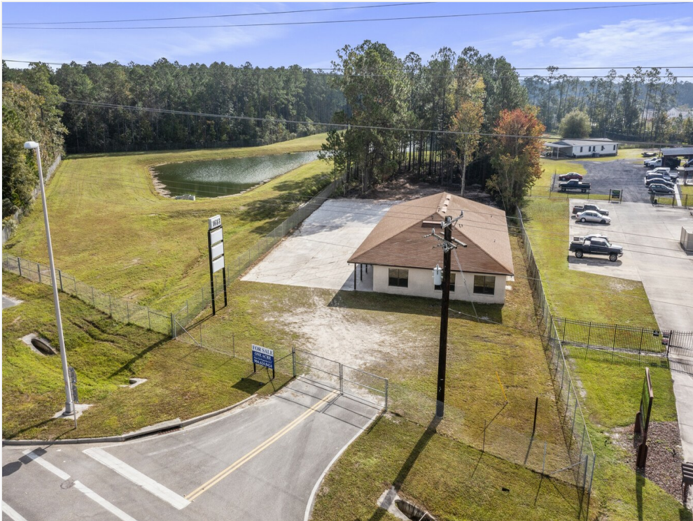
Blanding Blvd Entrance