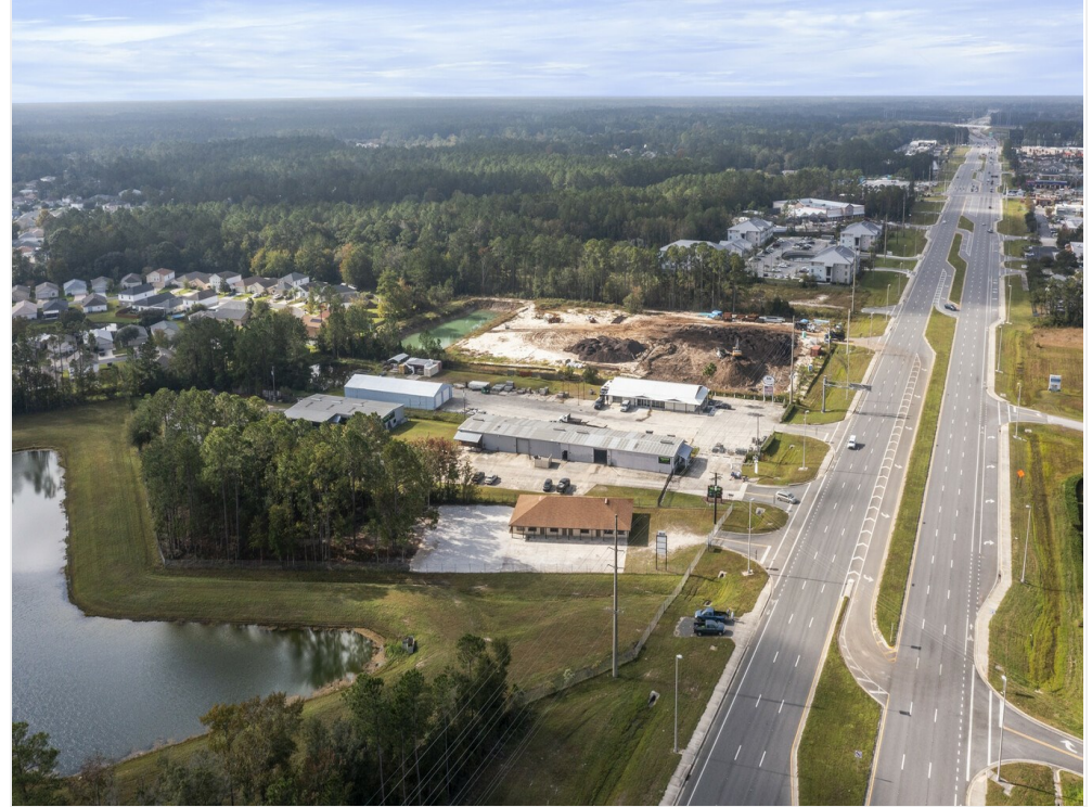
1 Mi To 23 Expressway