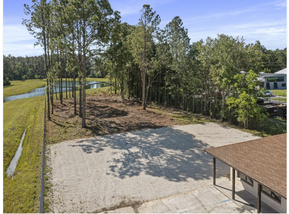
Back 1/2 Acre