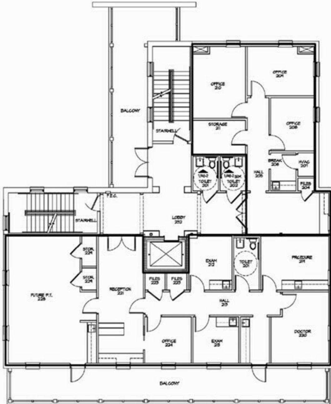
2 SECOND FLOOR PLAN A1-1 SCALE: 1" = 10'-0"