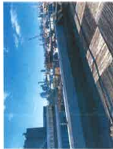
3256 STEINWAY REAR NYC CITY VIEWS