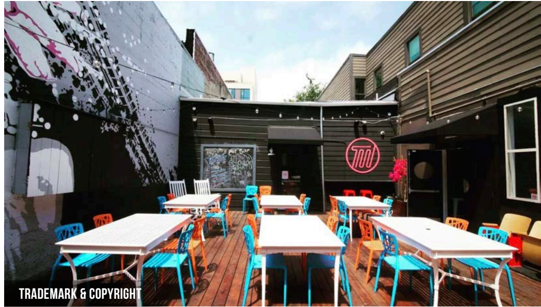
TRADEMARK & COPYRIGHT