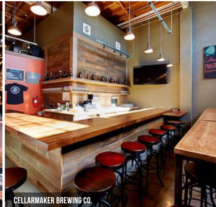
CELLARMAKER BREWING CO.