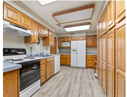
Full Basement Kitchen