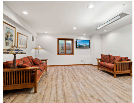
Bright, natural light basement lounge