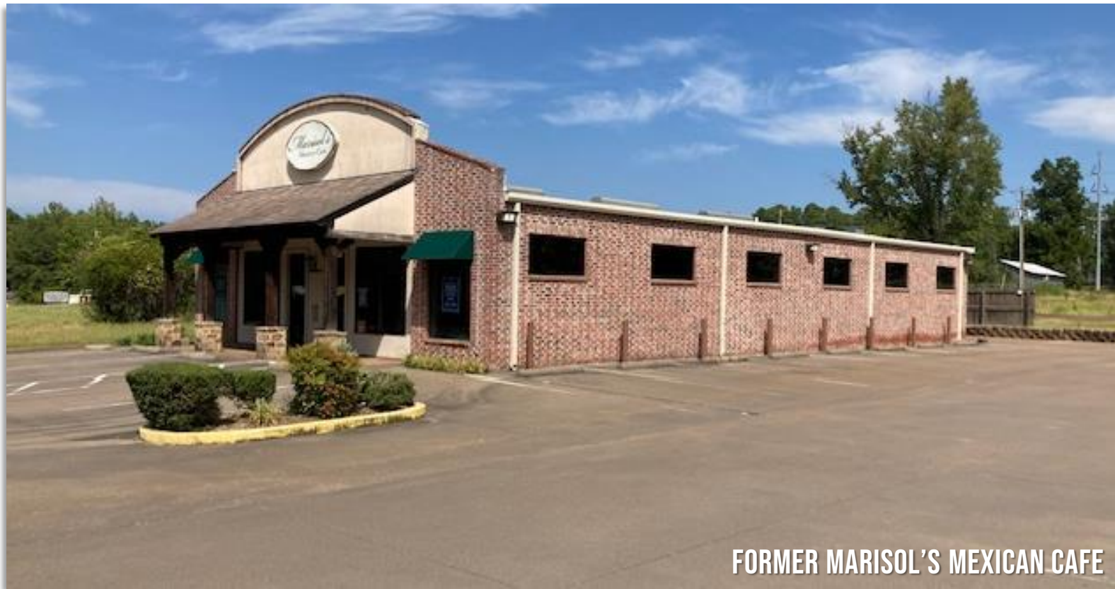
FORMER MARISOL'S MEXICAN CAFE