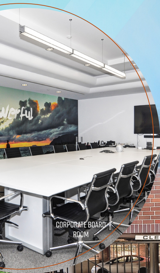
CORPORATE BOARD ROOM