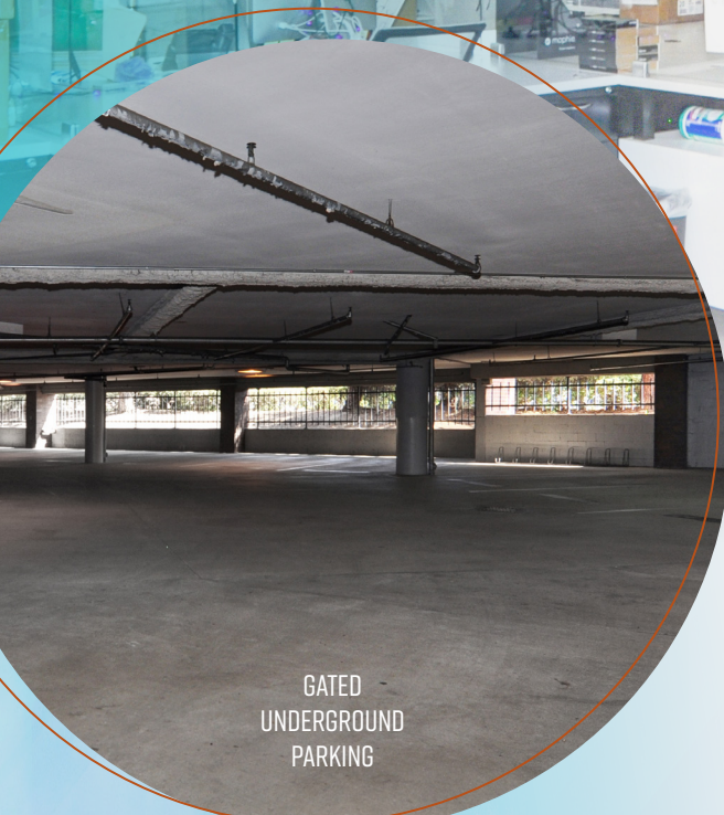
GATED UNDERGROUND PARKING