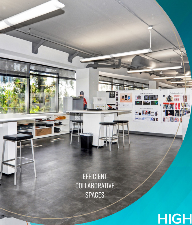
EFFICIENT COLLABORATIVE SPACES