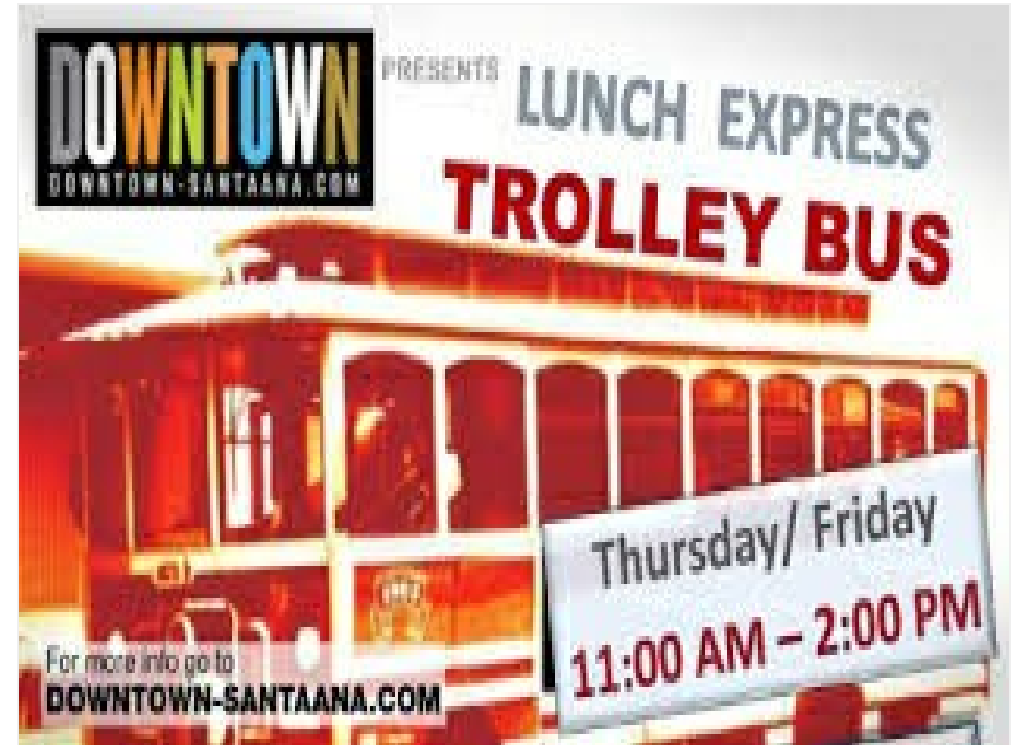
OC Streetcar coming soon