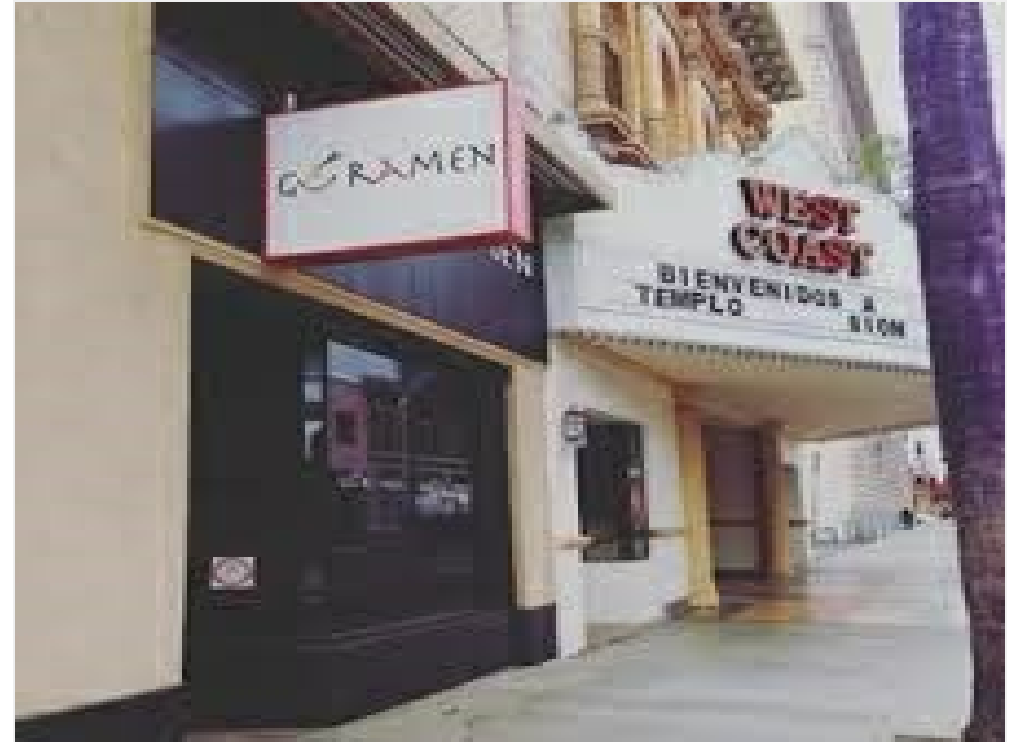
Gu Ramen on Main and 3rd