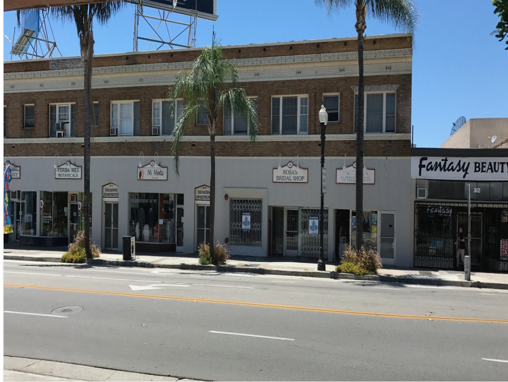
Broadway Street View