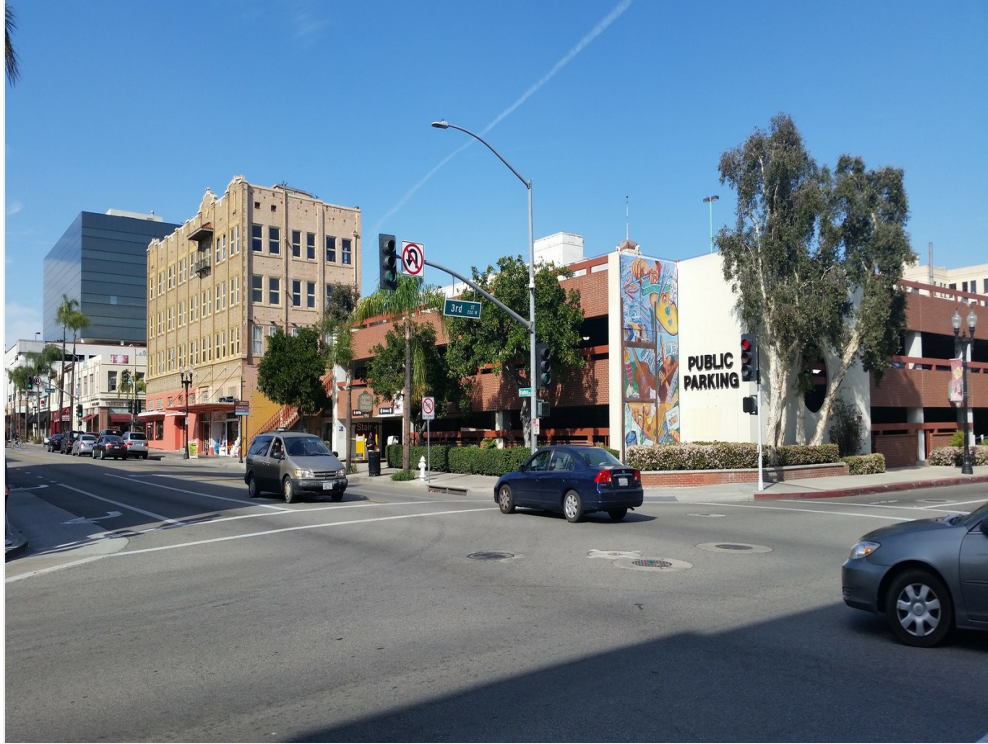
DTSA Parking Structure