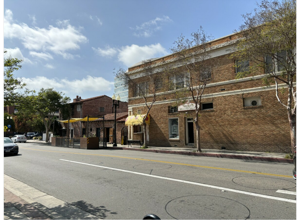
3rd Street view