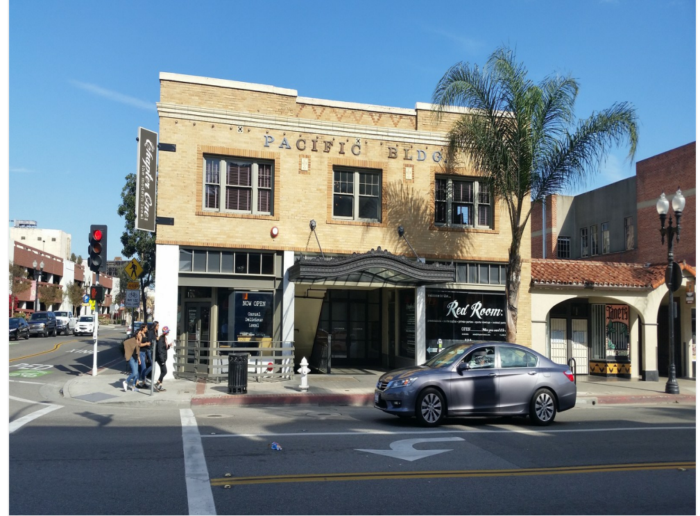
Chapter One Restaurant