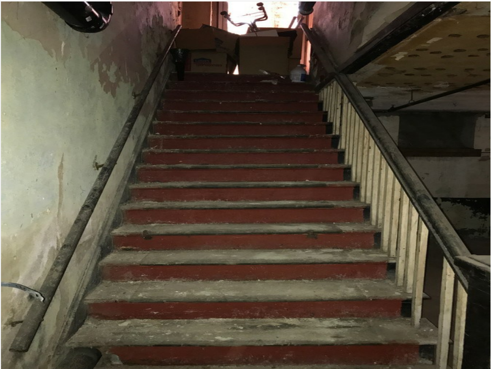
310 1/2 Basement access from Broadway