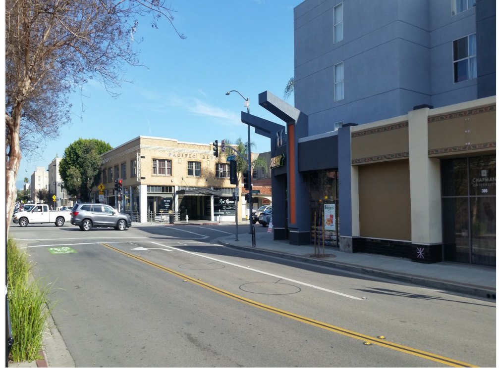
3rd Street View