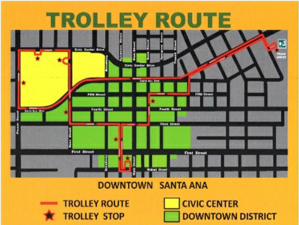
Lunch Trolley map