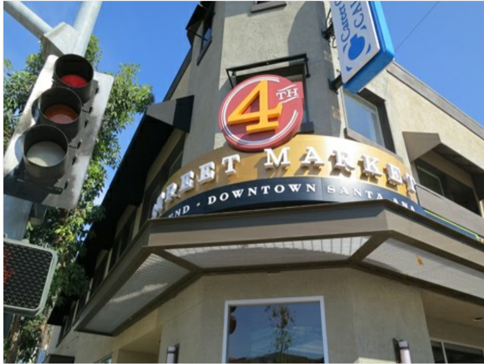
4th Street Market