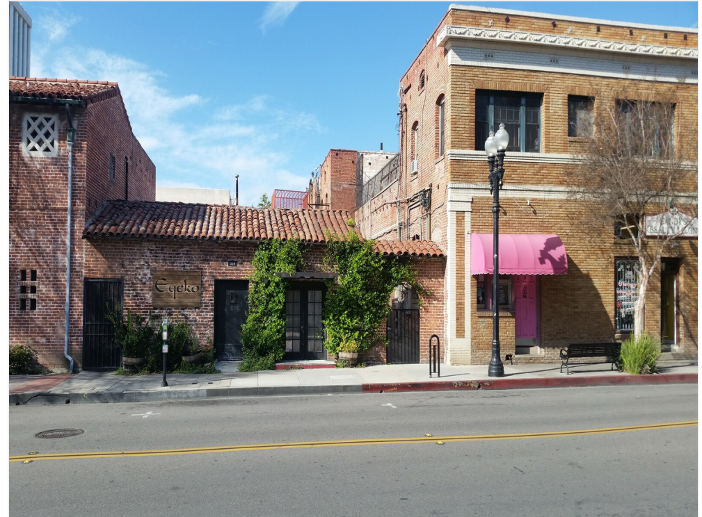
309/305 W. 3rd Street view