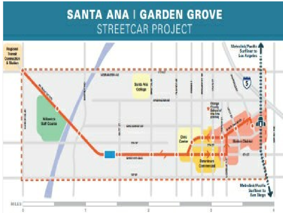
OC Streetcar coming soon