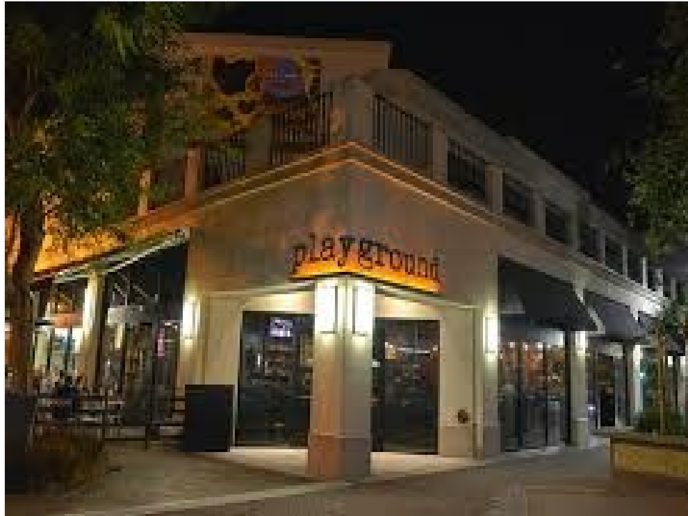
The Playground on 4th Street