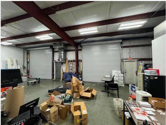
Suite 4 & 5