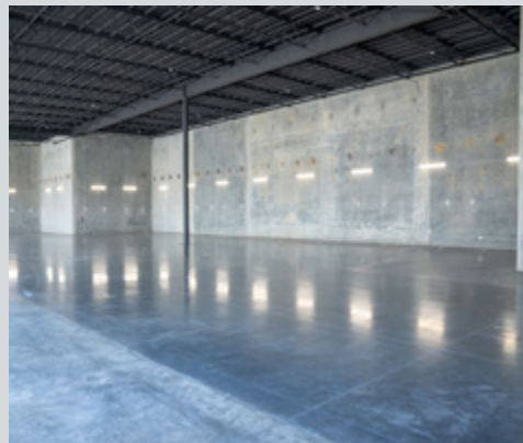
Building L interior photos