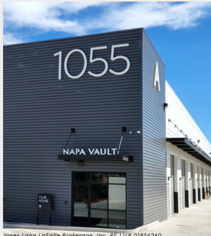
Jones Lang LaSalle Brokerage, Inc. RE Lic# 01856260

Although information has been obtained from sources deemed reliable, neither Owner nor JLL makes any guarantees, warranties or representations, express or implied, as to the completeness or accuracy as to the information contained herein. Any projections, opinions, assumptions or estimates used are for example only. There may be differences between projected and actual results, and those differences may be material. The Property may be withdrawn without notice. Neither Owner nor JLL accepts any liability for any loss or damage suffered by any party resulting from reliance on this information. If the recipient of this information has signed a confidentiality agreement regarding this matter, this information is subject to the terms of that agreement. ©2024. Jones Lang LaSalle IP, Inc. All rights reserved.