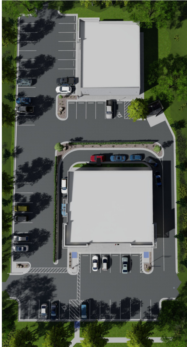
Site Plan - Overall

NWQ Loop 1604 & Lookout Rd | San Antonio, TX