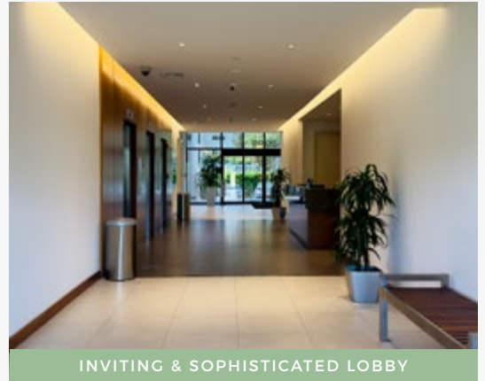
INVITING & SOPHISTICATED LOBBY