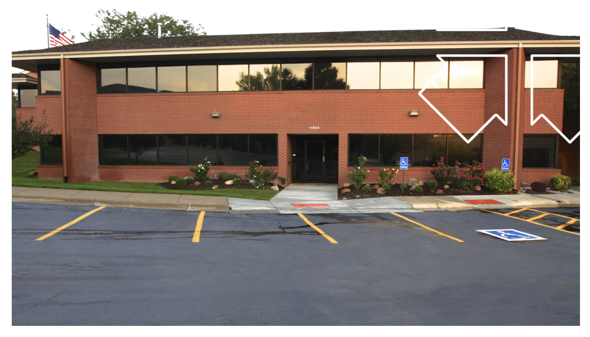
OFFICE FOR LEASE 11820 NICHOLAS STREET, OMAHA, NE 68154