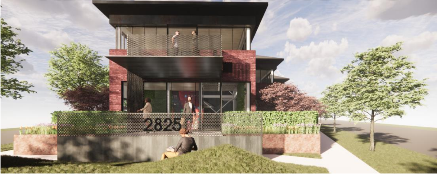
Outdoor Break Area