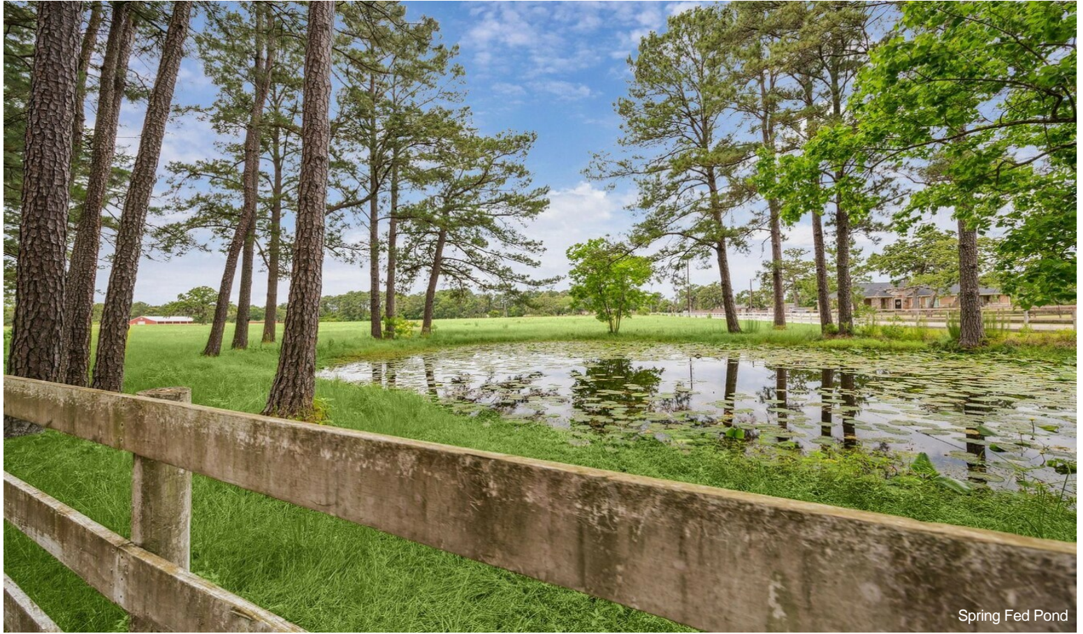
Spring Fed Pond