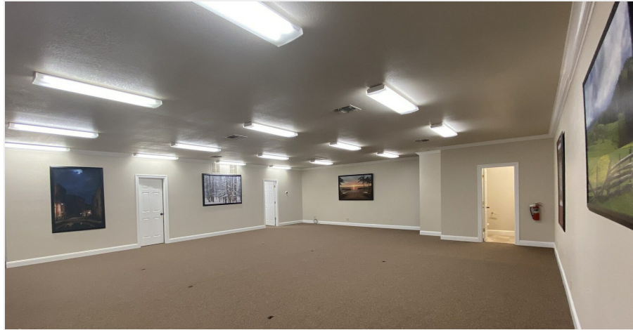
Large Reception Area