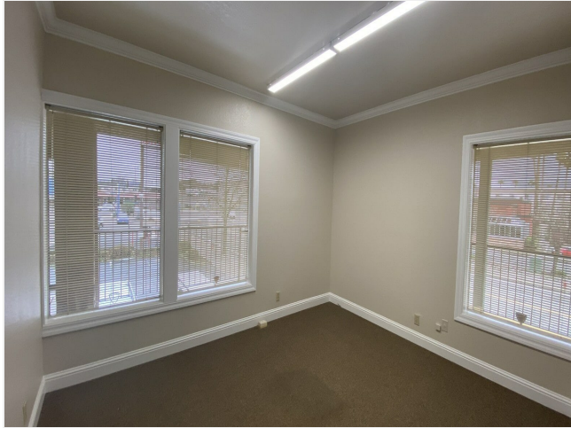
2 of 5 offices