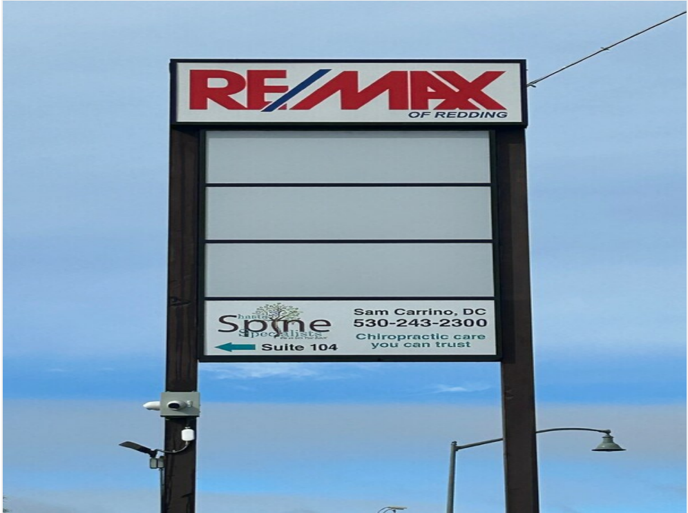
Lighted Sign Canisters