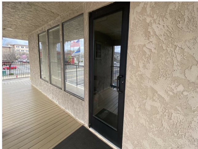
Second Floor Office