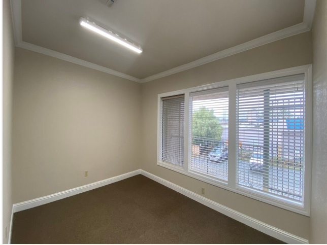
1 of 5 offices