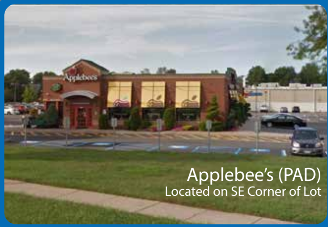
Applebee's (PAD) Located on SE Corner of Lot