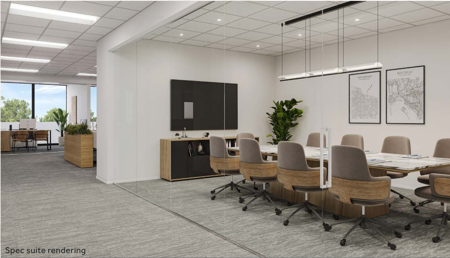
Spec suite rendering