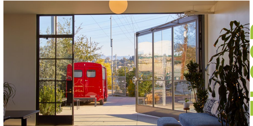
A— CUSTOM STEEL OPERABLE DOOR