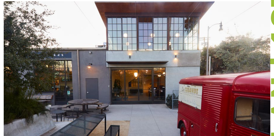
B— FRONT VIEW / OUTDOOR AREA