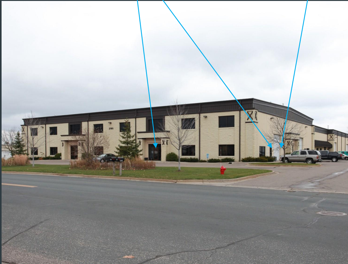
Suite 102 Drive-in Door