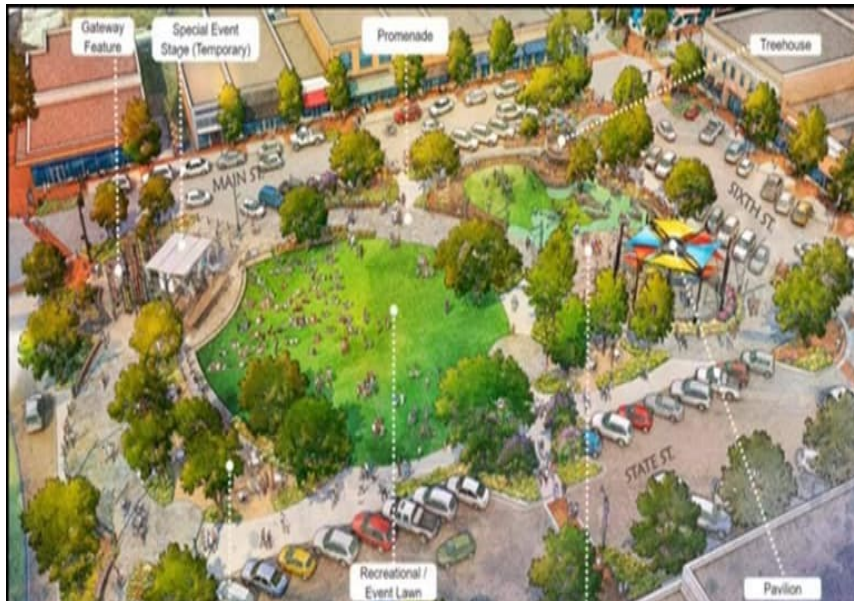
Renovated Square Plans