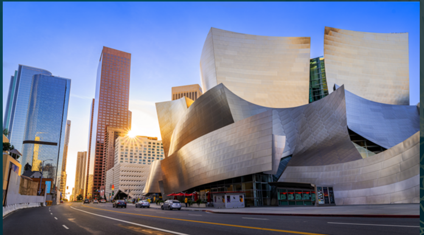
710 WEST 9 TH STREET, LOS ANGELES, CA